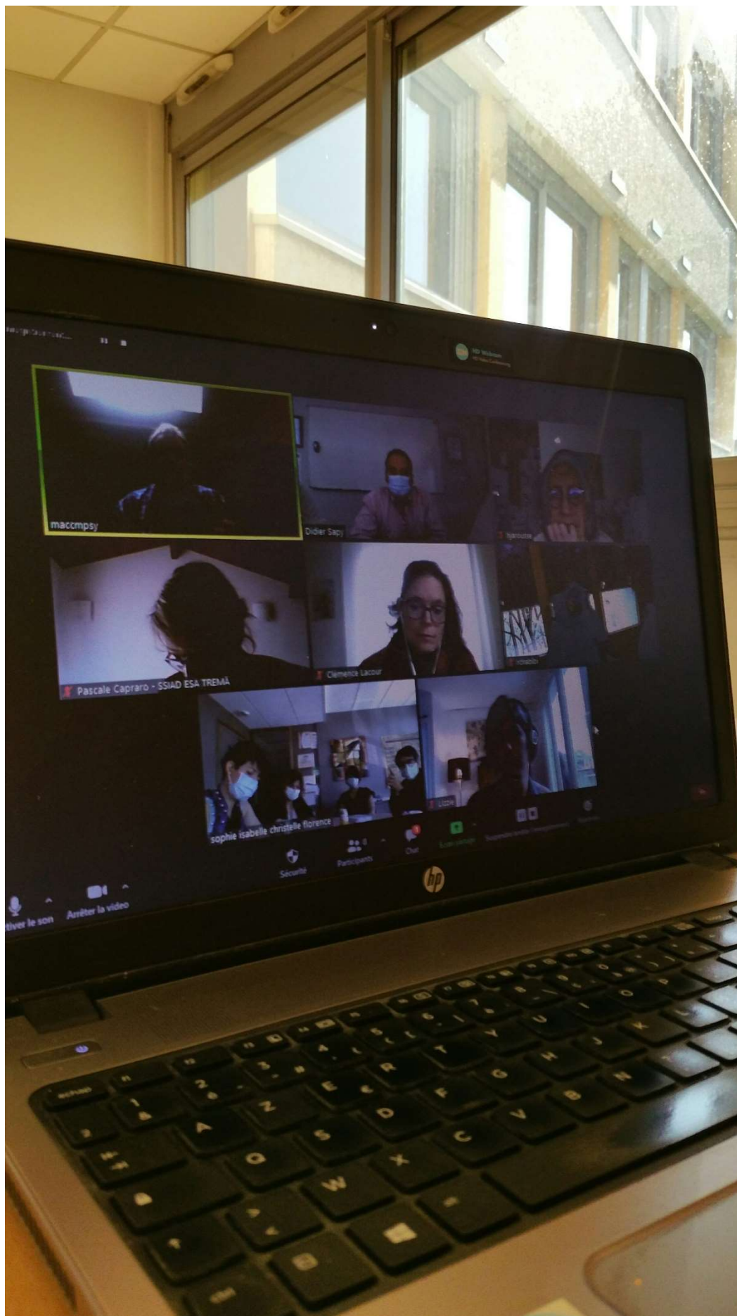
ERASMUS+ - AVEC – FNAQPA FRANCE – 1 st NATIONAL FOCUS GROUP - MINUTES